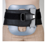
Anterior (front) Panel

CYBERTECH Ergo-Dynamic Panels Rigid anterior (front) and posterior (back) panels are easily removed with no tools. Panels can be added again when decreased range of motion is desired.